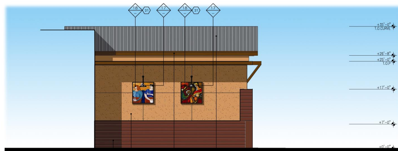
2. SOUTH ELEVATION