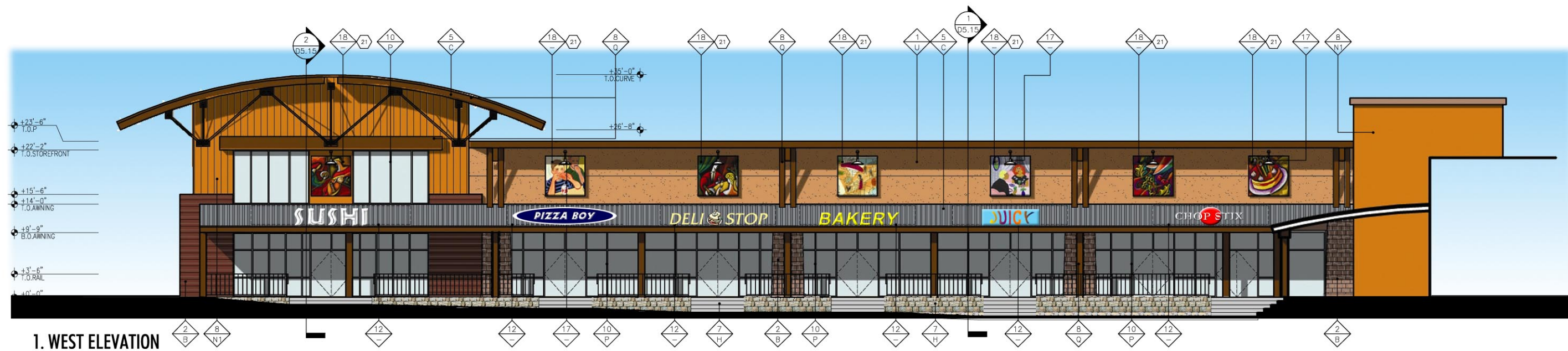
1. WEST ELEVATION