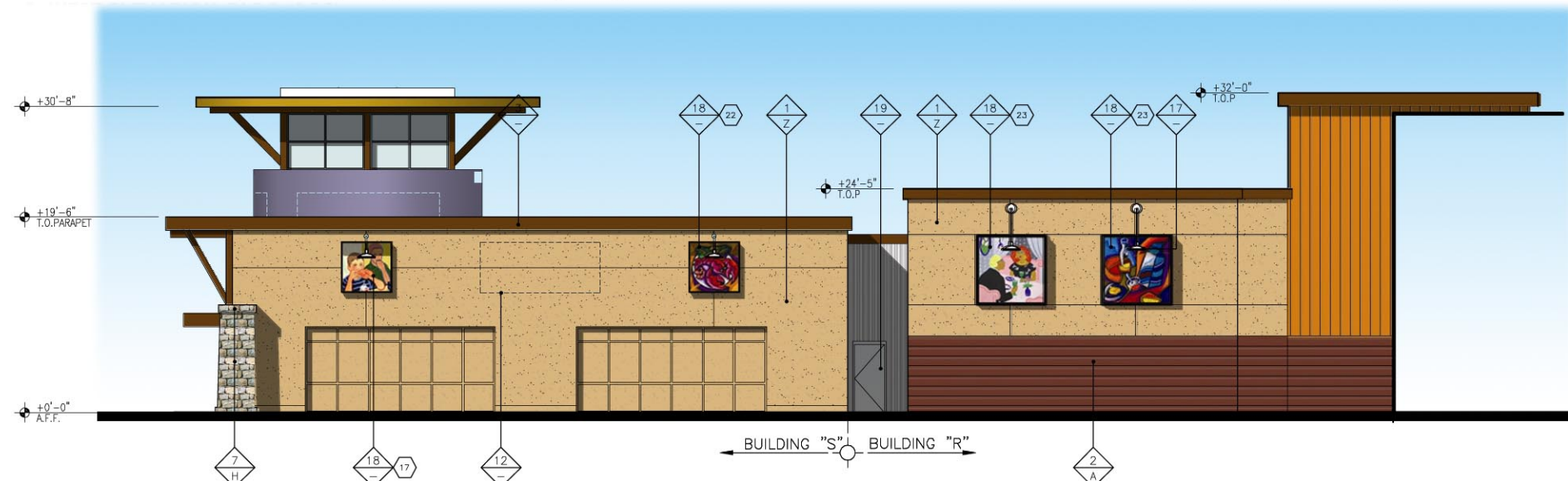
4. EAST ELEVATION-BLDG "R&S"