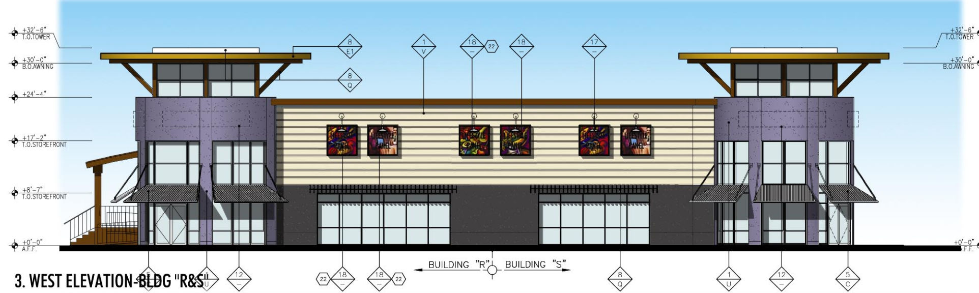
3. WEST ELEVATION-BLDG "R&S"