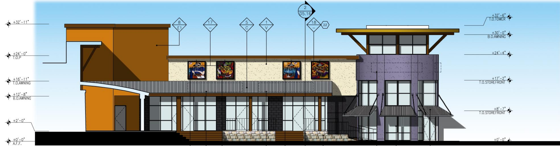
1. NORTH ELEVATION-BLDG "R"